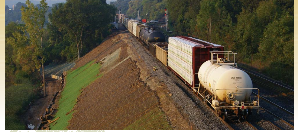
Royal Botanical Gardens, in conjunction with GO Transit, implemented an ambitious restoration project for the Sunfish Pond embankment and associated parts of the Valley Inn area of our Hendrie Valley Nature Sanctuary.

Protecting Paradise, a new grass-roots annual appeal in support of two of Royal Botanical Gardens' mandated areas, Conservation and Science, was successfully launched in November 2006. The Appeal raised over $100,000 in just six weeks. It also helped us tell the Royal Botanical Gardens story and update data bases. Planning for a new spring appeal, Nurturing Nature, in