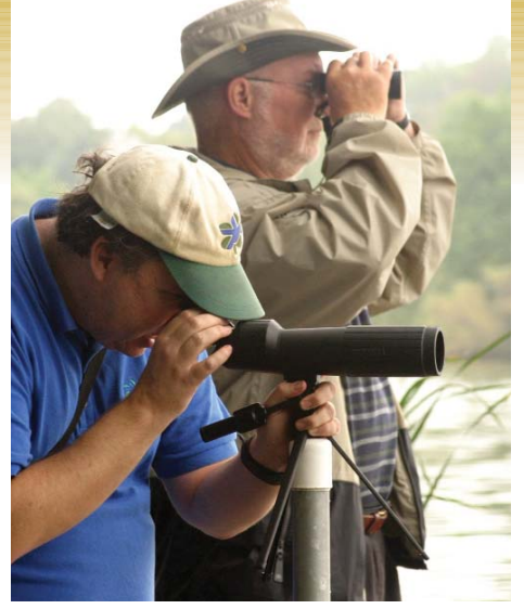
Bird watching at the Nature Interpretive Centre

Adult education activities were also on the grow. Our public program calendar spans a wide range of interests connected to our mandate, from how-to courses on gardening and birdwatching, to plant-based workshops such as chair caning, basketry and aromatherapy. Our 2006 numbers grew 45 percent over 2005, a trend that we are intent on maintaining. The fall symposium returned after a two-year hiatus and an appreciative crowd focused their attention on foliage in garden design.