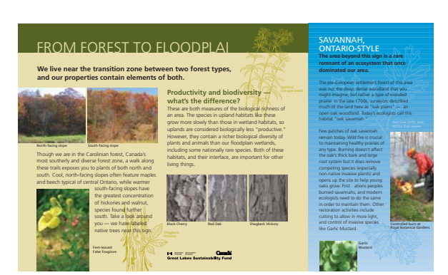
interpretive panel along Grindstone Marshes Trail

Our staff expertise is a valued asset that we share readily. Education staff were called upon to speak at conferences across Ontario including the national Risk Management in Outdoor Education conference, the Latornell Conservation Symposium, and the Ontario Society for Environmental Educators spring conference, as well as the Canadian Biodiversity Education and Conservation Colloquium in Vancouver.