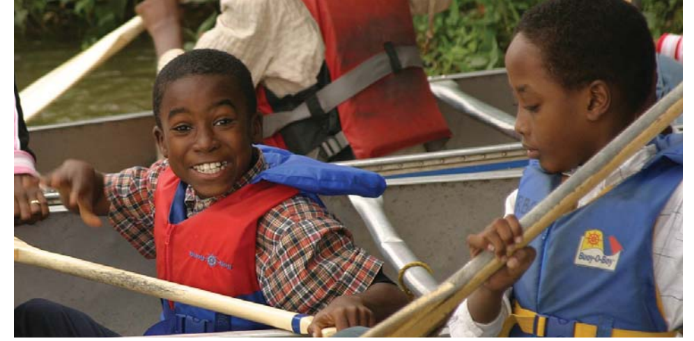
Canoeing in Cootes Paradise Marsh

Programs aimed at children continue to be a priority. While our educational initiatives target audiences from preschoolers to senior citizens, an investment in children's education pays huge future dividends in engaging individuals in environmental stewardship and building a community of support for the Gardens.