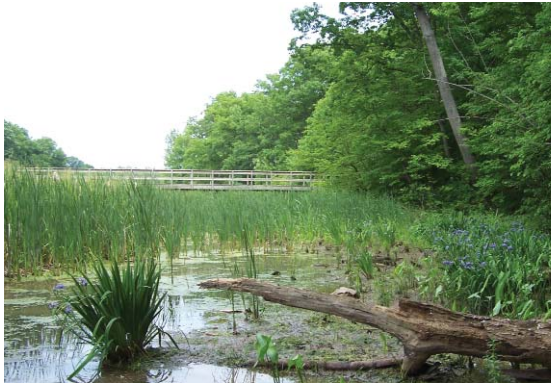
Hendrie Valley, wetland restoration