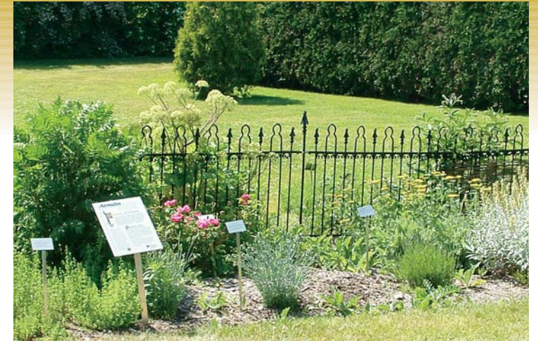
Medieval Kitchen Garden