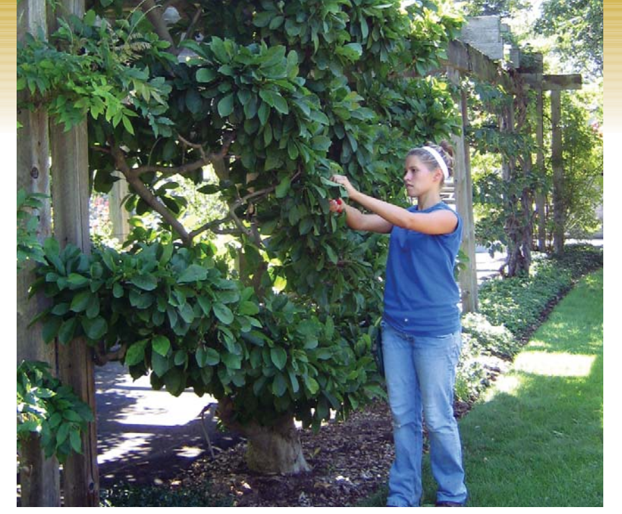
Working under the direction of our horticulture staff, students learn and earn over a summer work period spent at Royal Botancial Gardens.

2006 was the turning point for Horticulture, the year during which we began to move ahead on many fronts with the renewed commitment of Auxiliary volunteers, funders and staff, assisted by new attitudes and innovation.