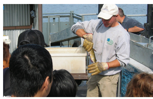
Talk to our experts and learn about careers in horticulture, science and conservation.