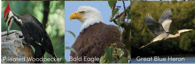
Pileated Woodpecker Bald Eagle Great Blue Heron

Part of the Niagara Escarpment World Biosphere Reserve Links to the Bruce and Waterfront trails