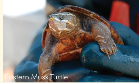
Eastern Musk Turtle

If you see one of these turtles, please call or email to tell us!