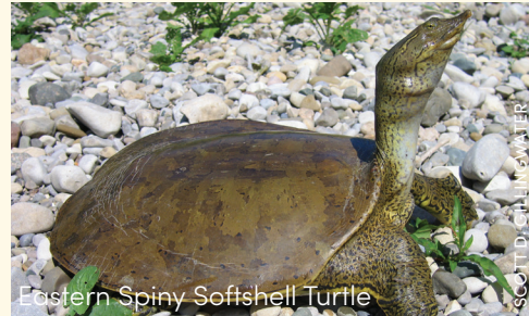
Eastern Spiny Softshell Turtle