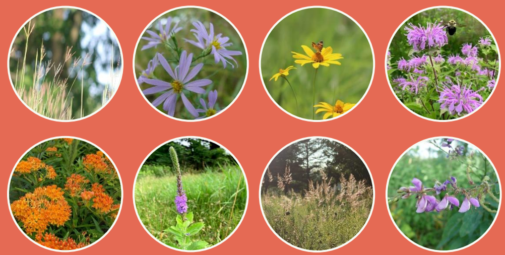
Prairie and Savannah plants found at Princess Point clockwise from top left: Big Bluestem ( Andropogon gerardii ), Smooth aster ( Symphyotrichum laeve ), False Sunflower ( Heliopsis helianthoides ), Wild Bergamot ( Monarda fistulosa ), Showy Tick-trefoil ( Desmodium canadense ); Indian Grass ( Sorghastrum nutans ); Hoary Vervain ( Verbena stricta ); Butterfly Weed ( Asclepias tuberosa ).

The plants found at Princess Point are indicative of rare tallgrass prairie and oak savannah ecosystems. These unique terrestrial ecosystems typically develop on sites with dry, sandy soils and rely on natural disturbances such as fire, drought and grazing to thrive. Royal Botanical Gardens' ongoing conservation efforts to improve plant, insect, bird, and mammal biodiversity at Princess Point have created a place where people can come and experience an extraordinary natural paradise where native plants take center stage.