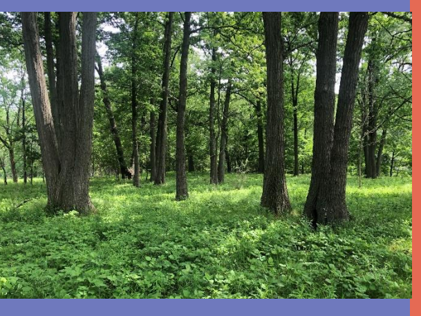
An oak savannah is a rare plant community of scattered oak trees above a layer of prairie grasses and wildflowers with few shrubs.

A tallgrass prairie is a treeless plant community dominated by wildflowers and sun-loving grasses that can grow over 5ft tall.